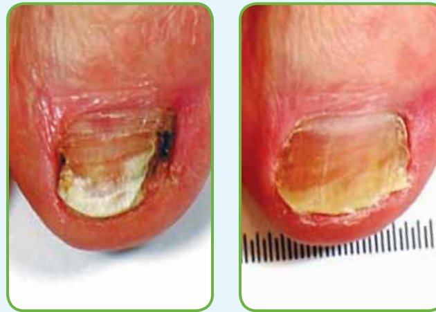
Start of treatment