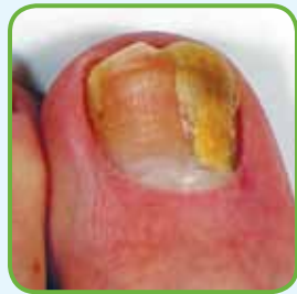
Start of treatment