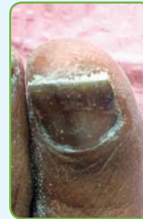
Sealed with Nuvail

If mechanical debridement is part of your treatment, ask your podiatrist how Nuvail can seal and protect your nail as it regrows, while immediately improving nail appearance.