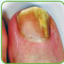
6 months with Nuvail